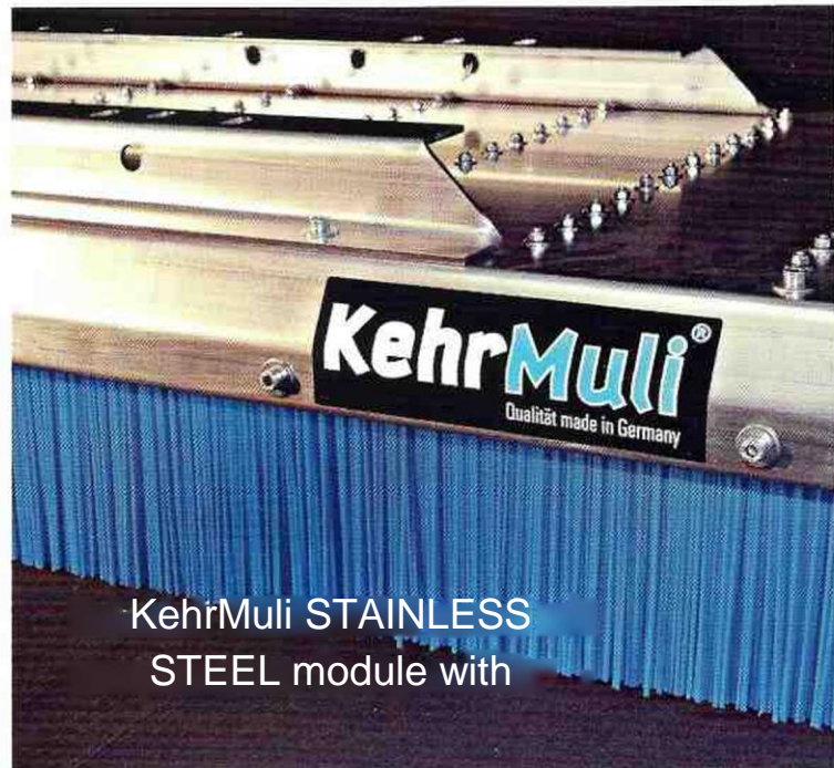
KehrMuli STAINLESS STEEL module with